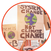
Climate Technology & Competition