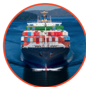
High Seas Treaty