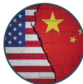
U.S.-China Trade Policy